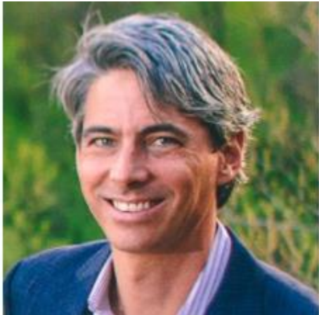
Chaos & Momentum