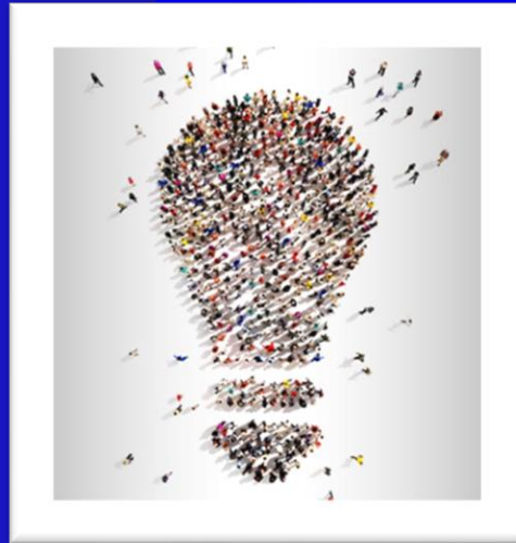
Wisdom of the Crowd