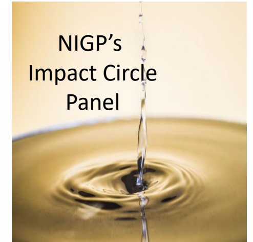
Embracing the Power of Change