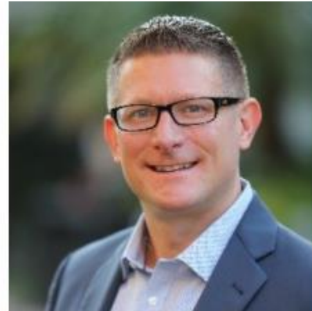
A Better Way to Great