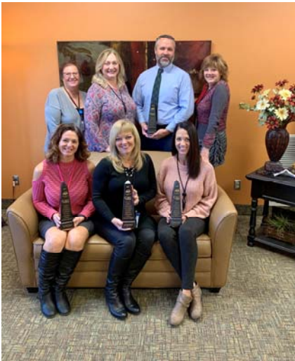
Davis School District

The AEP Award is earned by public and non-profit agencies that demonstrate a commitment to procurement excellence. This annual program recognizes procurement organizations that embrace Innovation, Professionalism, Productivity, Leadership, and e-Procurement.