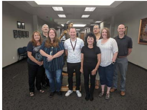
Granite School District