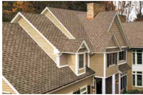
Ohio's Premier Roofing and Building Materials Distributor