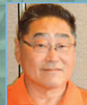
Region 12 Nelson Park, CPPO, CPPB